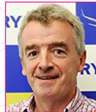
Michael O'Leary CEO Ryanair