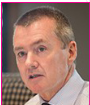
Willie Walsh CEO IAG