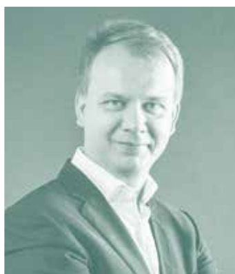
DR MIROSLAV BEBLAVÝ, Associate Senior Research Fellow and Head of Unit, CEPS

Miroslav Beblavý is a Senior Research Fellow at CEPS (since 2009) and a Member of the Slovak Parliament (since 2010). Until 2014, he was also the Associate Professor of Public Policy at the Comenius University in Bratislava, Slovakia. Between 2002 and 2006, he was the State Secretary of the Ministry of Labour, Social Affairs and Family in Slovakia responsible inter alia for management of the ESF in Slovakia, as well as employment and social policy. Between 2001 and 2002 as well as between 2006 and 2010, he was the Executive Director of the Slovak Governance Institute and also conducted consultancy work for numerous international organizations including the European Commission, OECD, World