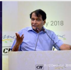
11-12 December 2018