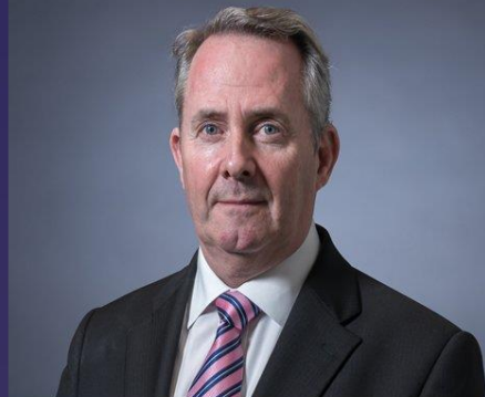
Dr. Liam Fox, Secretary of State, Department for International Trade

"The UK and India share a vision for a deep and dynamic partnership in which the 2 governments and business work hand-in-hand to achieve shared prosperity."