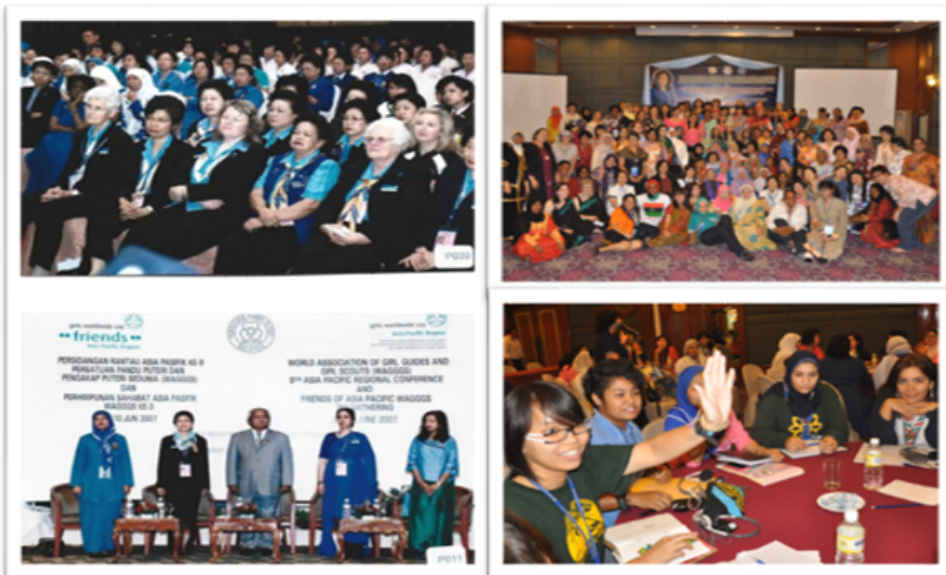
AP - Arab Regional TOT 2011