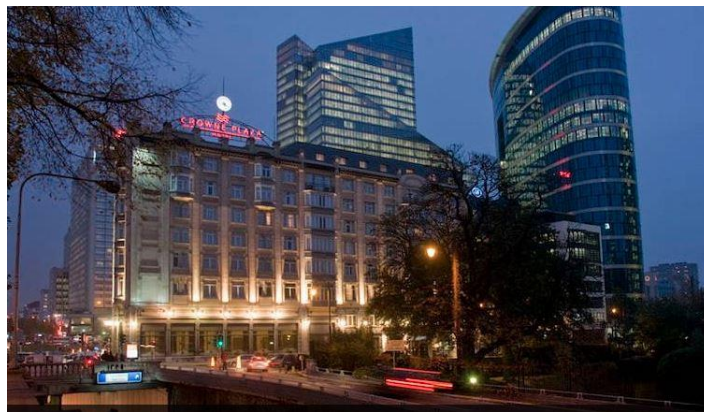
Crowne Plaza Brussels – Le Palace

The venue for the Seminar on the Social Pillar and European Semester as Tools for Delivering Social Europe is the Crowne Plaza Brussels – Le Palace Hotel , Rue Gineste 3, 1210 Brussels, Belgium. Tel: +32 2 2036200. The Hotel has a smoke free policy throughout (including E-cigarettes and VAPE devices).